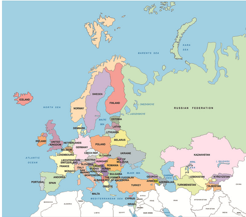
Map: Europe and Central Asia 20

Highly diverse, the region of Europe and Central Asia 19 includes high-income economies of Western Europe; high- and middle-income countries from Central Europe which have joined the European Union (EU); middle-income countries of